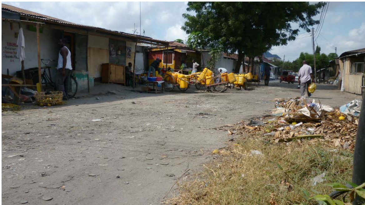
Exhibit 4 Water Vendor Station